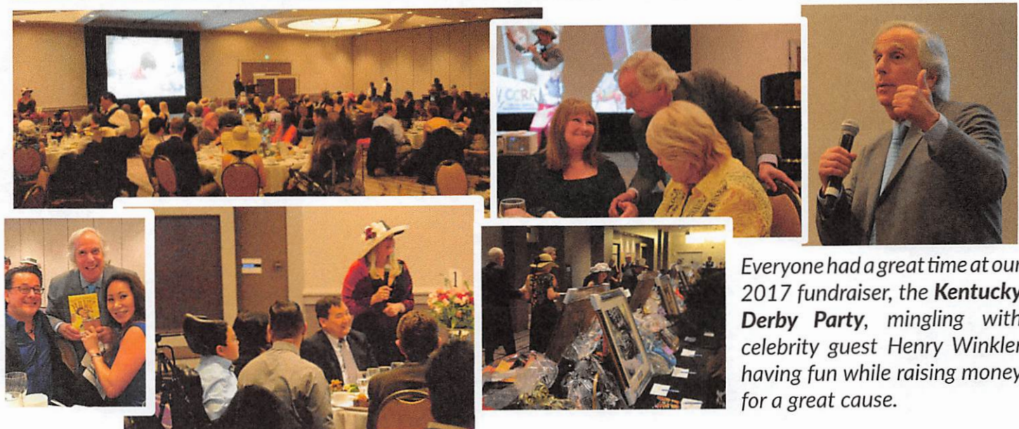
Everyone had a great time at our 2017 fundraiser, the Kentucky Derby Party , mingling with celebrity guest Henry Winkler having fun while raising money for a great cause.